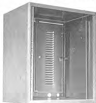
New Type 1460 Transmitter Cabinet

and Foundation Units-- with Modern Rounded Corners