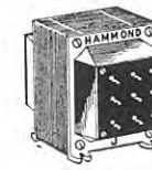
TYPE 1143 203A FILAMENT