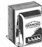
TYPE 524 LINE TO GRID