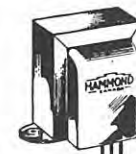
TYPE 330 TUBE TO LINE