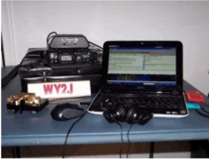
Fig. 1 QRP Vacation Station in Test on 20 M.

Part of this station is shown in Figure 1 running 5 watts to a dipole in PSK-31 mode with everything on battery power.