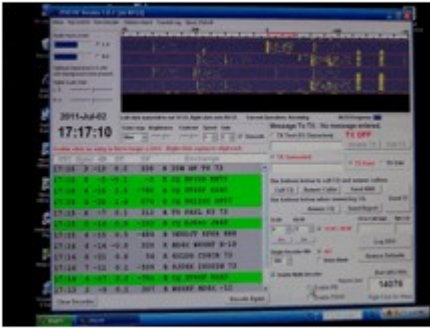
Fig 2. JT65-HF Operator Screen on 20 Meters

Next month I will cover a couple of practical antennas for a portable station, complete the mode work and report on the anticipated performance for each mode. After I return from Ocean City you will find out how well this station worked in the real world in a future HAM TECH column.