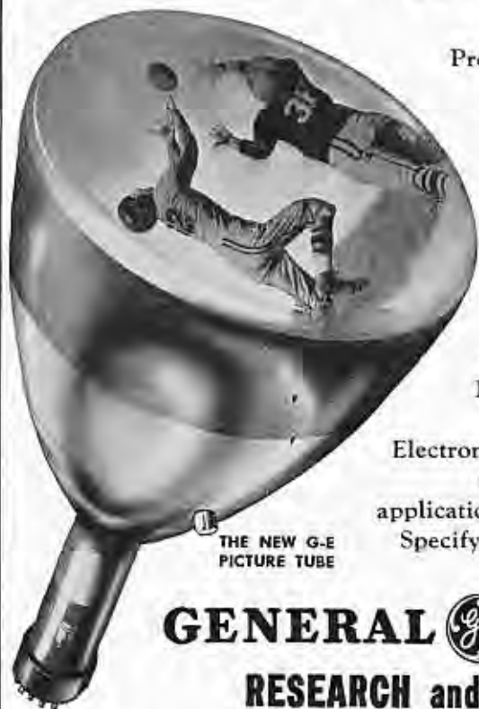
THE NEW G-E PICTURE TUBE

Production of the first made in Canada Television "picture tube" has recently been completed. This newest electronic development is the result of the careful planning that characterizes Canadian General Electric leadership in radio, television and electronics. Planning ahead has created the complete line of G-E Electronic tubes for radio receiving, transmitting and industrial applications and now for television. Specify G-E for quality and service.